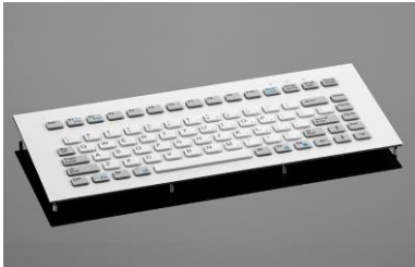
DS83S with Bolts

We offer this keyboard in different variants. Are you interested in any of the following solutions? Just get in touch with us.