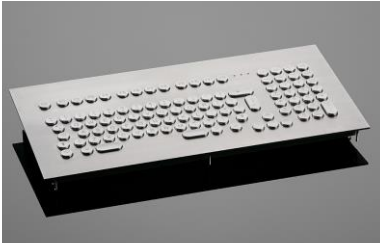
102T-ES Finger Mouse