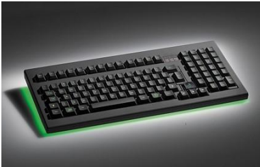
DS104W with Backlight