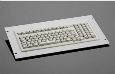
DS104W Built-in version

We offer this keyboard in different variants. Are you interested in any of the following solutions? Just get in touch with us.