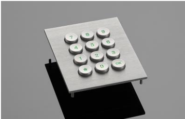
12T-ES19 with Backlight