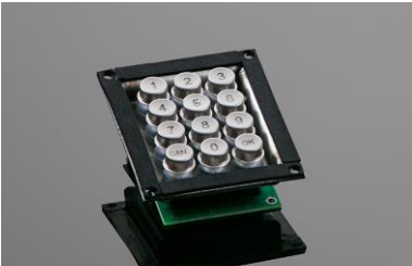
12T-ES w/o Front Panel

Here is a selection of similar keypads. Are you interested in any of the following solutions? Just get in touch with us.