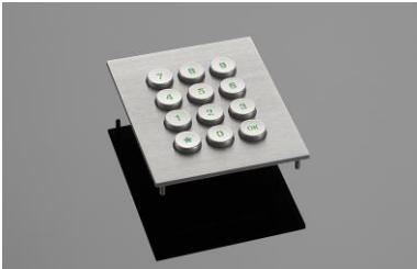
Backlit 12T-ES-HL ▶