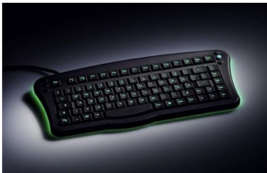
DS86W with Backlight