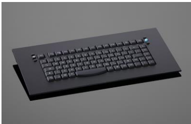
DS86W Front Panel

We offer this keyboard in different variants. Are you interested in any of the following solutions? Just get in touch with us.