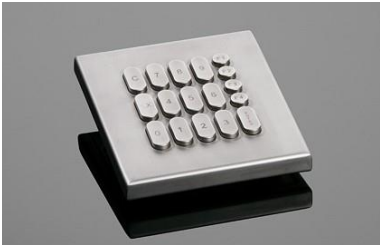
30T-ES Special Layout