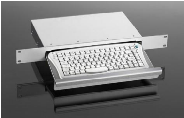
DS 86W Drawer