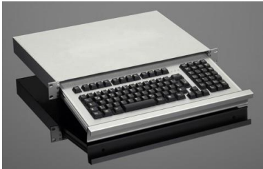
DS 104W Drawer

Here is a selection of other drawer keyboards. Are you interested in any of the following solutions? Just get in touch with us.