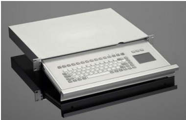
DS 83S-TP Drawer